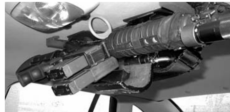
Squad Car Roof Rack